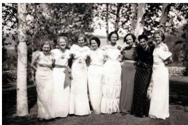
1935 Venetian Queen Court

The young ladies that participate in the Miss Charlevoix Venetian Queen scholarship competition serve the Charlevoix community as its ambassadors. The young women that participate in the competition are required to write an introduction letter, an essay, prepare and present one persuasive speech, and complete both panel and personal interviews with judges that are selected from outside the Charlevoix Community. Each candidate is judged completely on her own merit. Queen Scholarships are awarded at the end of her reign and are paid toward the school that she is attending. The scholarship funds are provided by the Charlevoix Venetian Festival through generous donations.