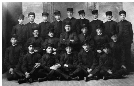
Charlevoix City Band circa 1905

July 22 • East Park Odmark Pavilion - 8 p.m.